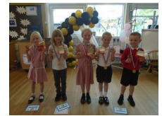
100% All year Attendance