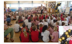
Leavers Awards Assembly