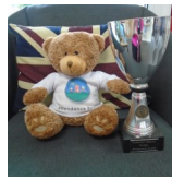
Attendance Bear & Cup