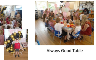
Always Good Table